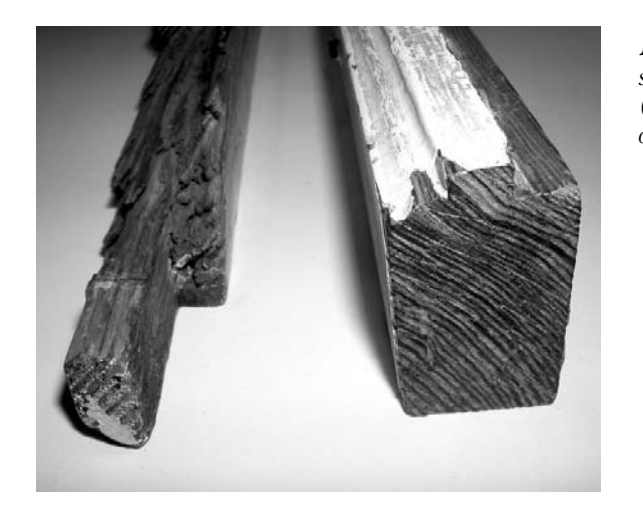
Figure 4 Window sections 15 years old (left) and 150 years old (right).

After the Second Word War, people disregarded quality and ignored the lessons of the past. Today we have many problems with windows and doors that are no more than 10 or 15 years old (Figure 4). In order to save as much of the older, good-quality material as possible, we have rediscovered simple techniques for repairing sashes and frames. We use