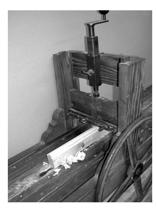
Figure 3 Modified copy of a planer from the early eighteenth century.