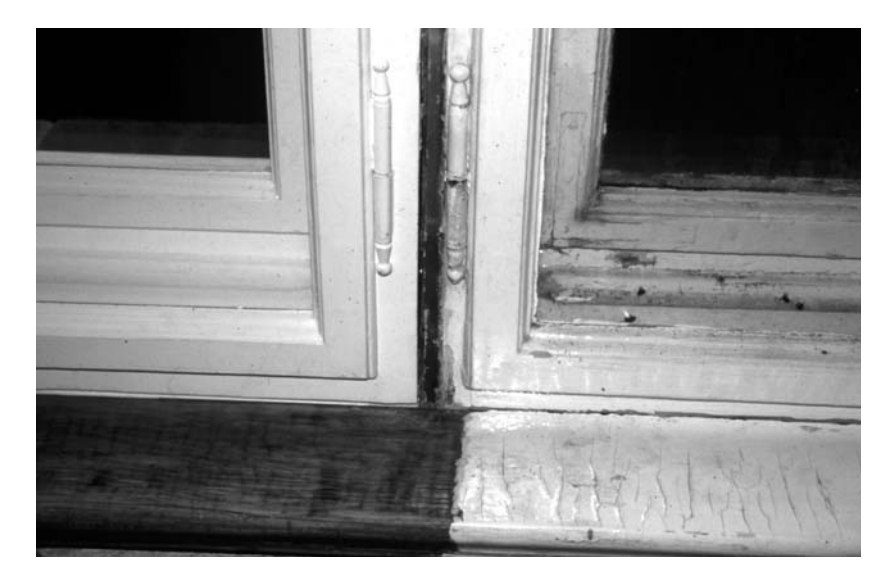
Figure 5 Window from 'Kastenfenster' in Leipzig dating from 1880.

completely removed. The outer and inner frames were fitted together and minor damage caused during transportation was repaired. After impregnation with raw linseed oil, the windows were re-glazed using linseed-oil putty of our own manufacture. Our goal was to keep the milled glass in the outer casements. As an experiment, we used 3 mm Pilkington Kappa Energy glass (K-Glass) in one of three inner casements, in order to show the differences in colour and light. Nobody noticed the difference.