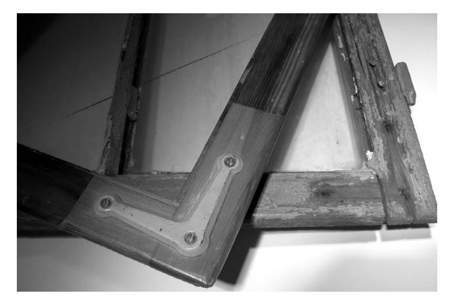
Figure 1 Windows from 1880, showing small-scale repairs.

Economics forced us to invent the simple weatherproof temporary window that made it possible to work all year around. We also made a small adjustable platform to reach windows at any height.